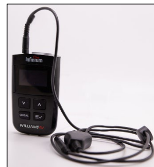
Auracast receiver with neckloop.

Equipment shown: Top: ListenTech/Ampetronic. Bottom: WilliamsAV.